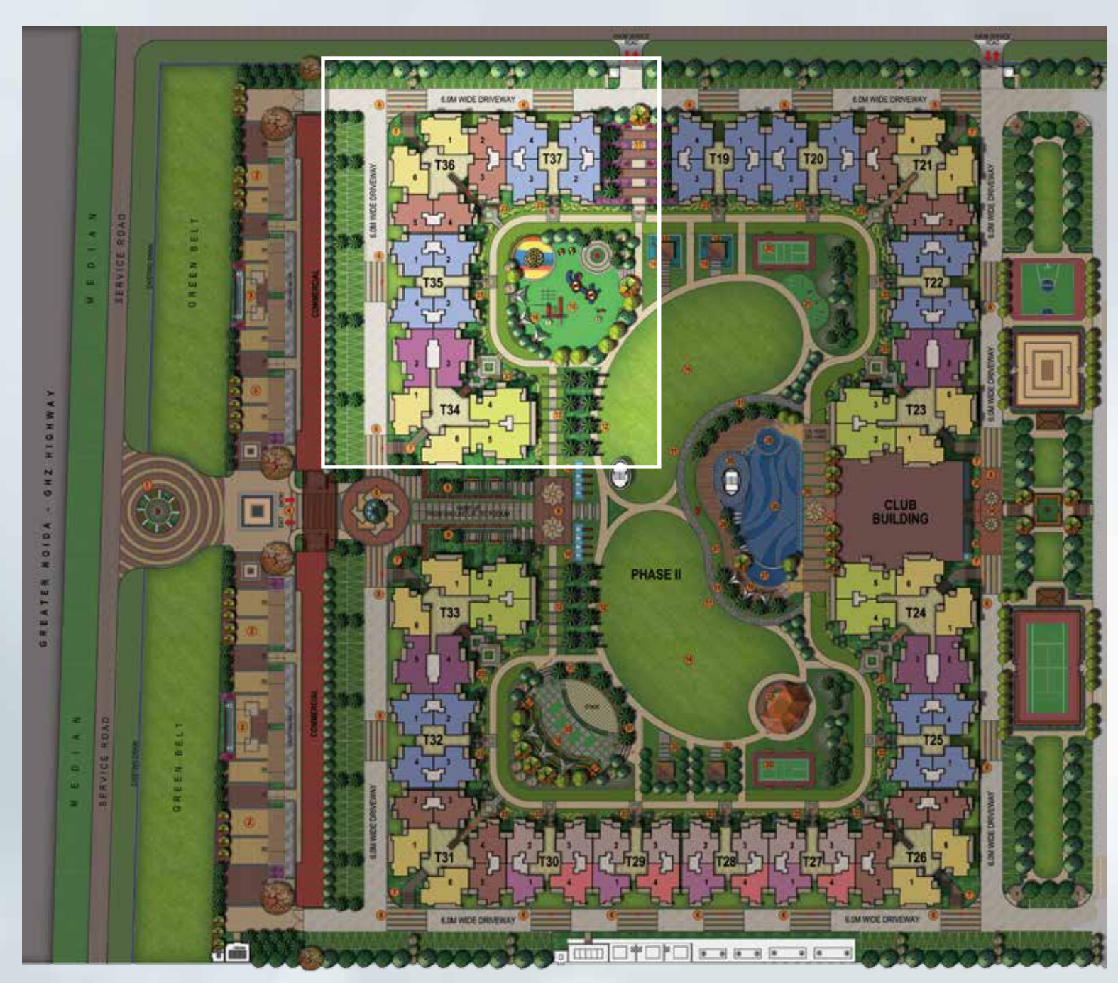
Note: The facilities & amenities mentioned above are part of different phase/project in total project, and will be available for use after development of respective phase/project.

These are purely conceptual and constitute no legal offerings. 1sqm = 10.764 sq. ft.